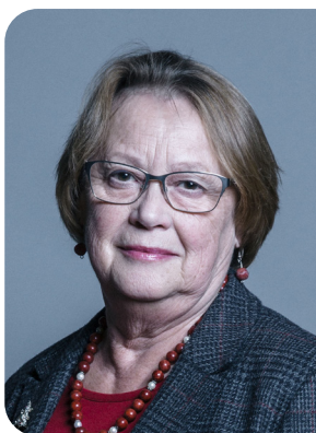
Baroness Cathy Bakewell Vice-Chair of the All Party Parliamentary Group on Gypsies, Travellers and Roma

The guide is based on research funded by the Joseph Rowntree Foundation, undertaken by De Montfort University in Leicester and published by the Chartered Institute of Housing in 2016. 1 This showed how vital it is for existing sites to be well managed, before seeking political and public support for plans to build new sites. The 2016 study identified a list of essential ingredients for effective site delivery and management, which this guide amplifies and illustrates with successful case studies from across the UK.