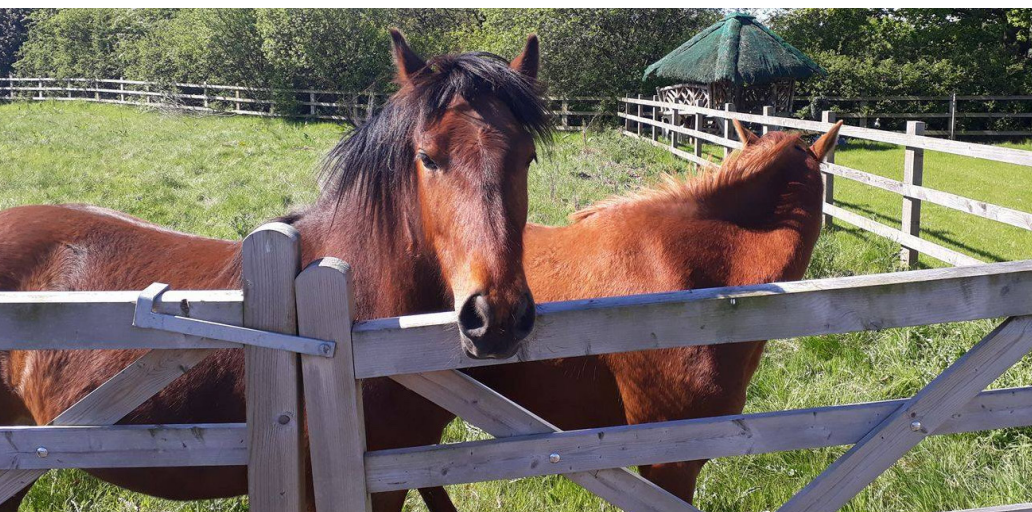
An enduring and important part of Gypsy and Traveller life – horse paddock at Rooftop Housing Group's Gables Close site in Solihull.