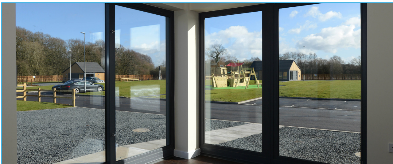
Interior and view of shared space and amenities at Gables Close.

Rents are in line with local bedsit accommodation and are sufficient for the scheme to break even in 23 years after completion. Total scheme costs were £1.2 million (including £960,700 works costs), funded by Homes and Communities Agency grant of £575,000 and a Rooftop loan of £635,739.