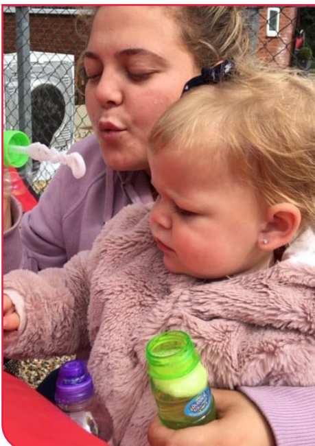
Brooks Green – building a stable, successful and happy community.