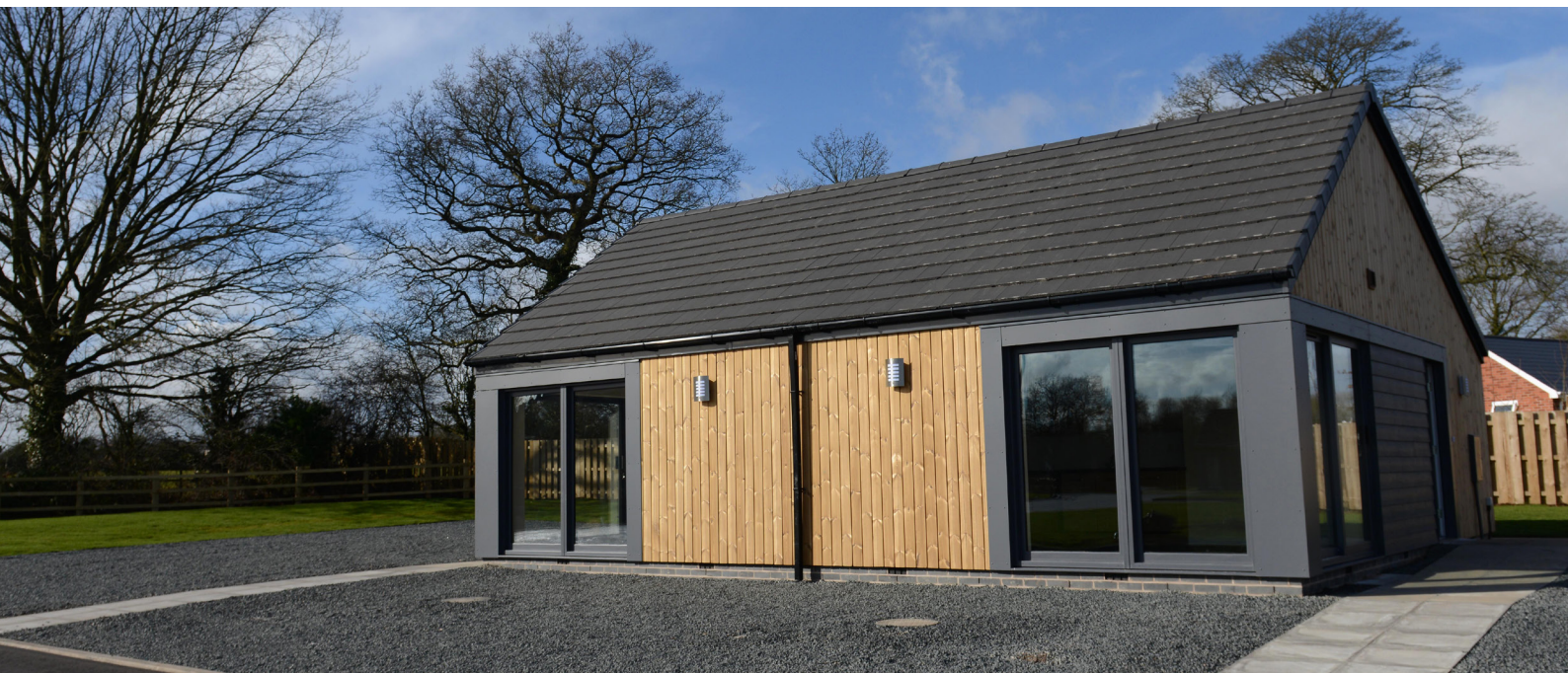
Good planning pays dividends – attractive homes using materials that complement the surrounding landscape..

Broadland Housing took the strategic decision to apply to the Affordable Homes Programme to fund an additional site for Gypsies and Travellers. In January 2021 the group secured £806,000 in grant from Homes England for a scheme in Norwich to provide 13 pitches. Developed as a partnership with Norwich City Council, the new site had a ten-month timetable for completion with particular emphasis on good design and build quality.