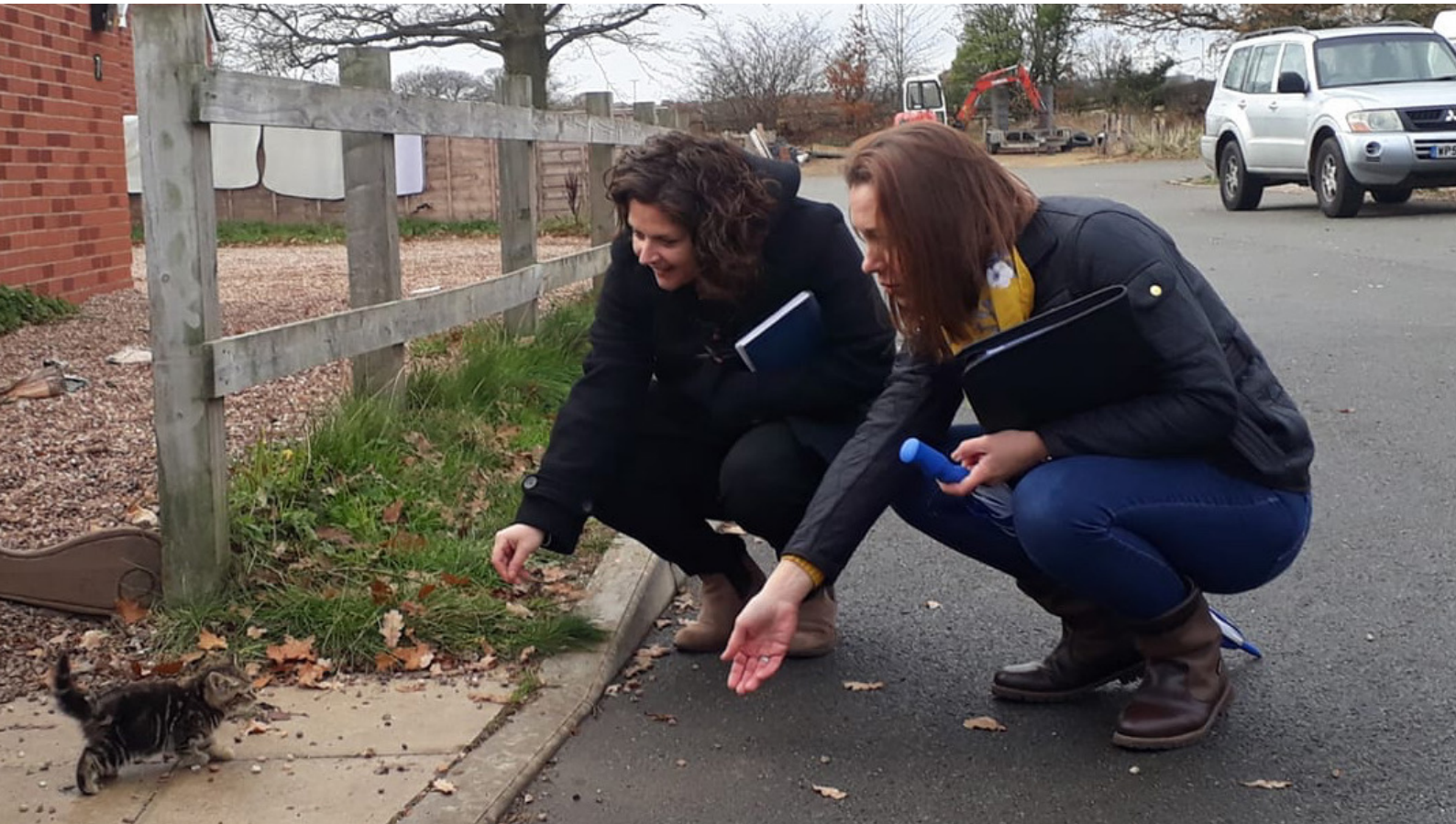
A site resident meets staff from Rooftop Housing Group's Money Advice Team.

The lower density of occupation and profile of some people's needs mean that intensive management is required on Gypsy and Traveller sites. This needs to be reflected in the financial model for their development, supervision and upkeep, and is why government grant support in the form of higher levels of capital grant funding and revenue support for intensive housing management are required. Putting in place strong management and intensive support reaps longer term rewards in happy residents and homes that are well looked after.