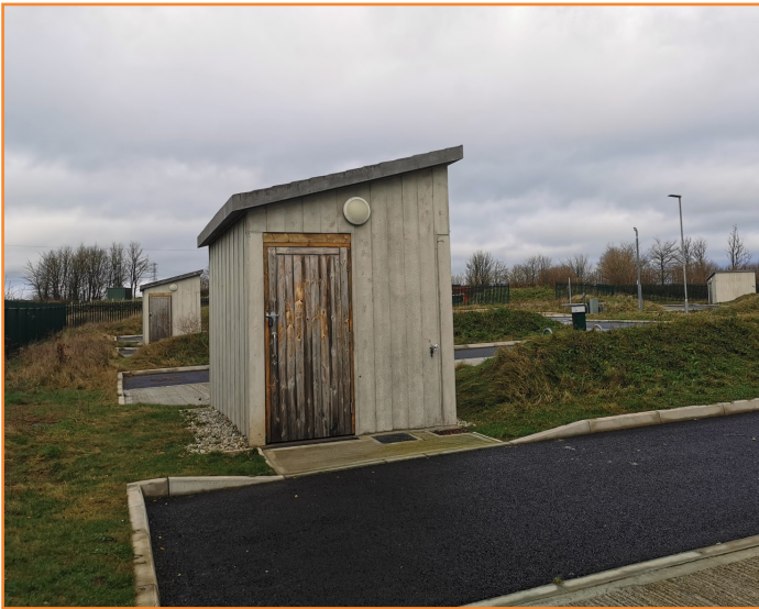
Safe parking and toilet facilities at South Treviddo.

This site has many elements of best practice in design. It's based on the recommended circular design, with occupiers' safety and security a high priority. A closed circuit television system sends a continuous live feed to a monitoring station, and there's adequate and appropriate lighting throughout. The site is located near to a dual carriageway, but careful planting design creates an effective noise break and privacy.