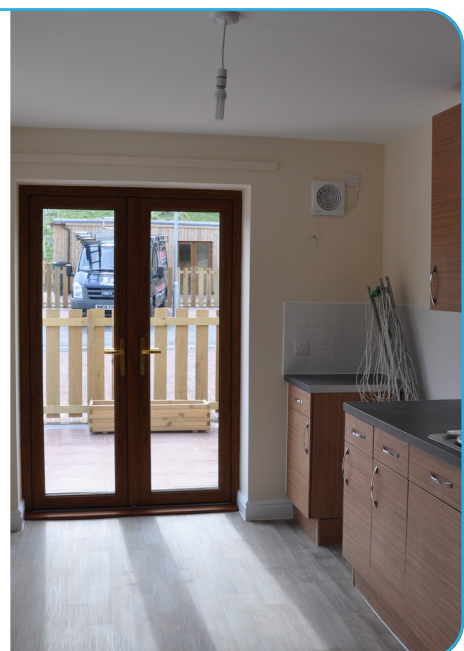
Utility room at Elim Housing's Carrswood View site in Bath.

Rooftop puts and keeps residents at the heart of its approach, from initial site concepts stage through to delivery and management. To keep people engaged, earn their trust and learn lessons the organisation involves end users in site design, taking care to consult about and include customers' knowledge and preferences. Asking children about the design of play areas is especially important. Developing good links with people before they become tenants is invaluable in building longer term sustainable and professional relationships with occupiers, their families and visitors.